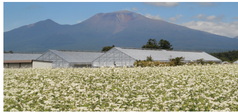
Asama Panorama Street

Naka-Karuzawa features several spots where you can get up close to nature, such as Sengataki Falls and the Wild Bird Forest. The Lake Shiozawa area, known as a cultural region, is dotted with art and literature museums and parks as well.