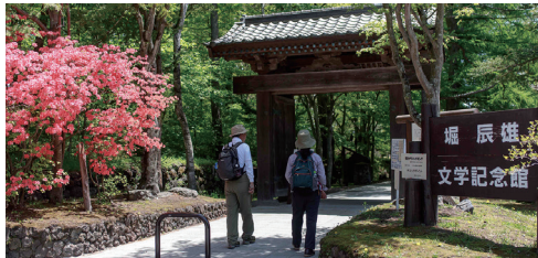
Hori Tatsuo Museum of Literature

During the Edo Period, the Oiwake post town, located at the crossroads of Nakasendo and Hokkoku Roads, was the most prosperous of the three post towns at the base of Mt. Asama. Oiwake was visited by many writers and poets who loved Karuizawa and is renowned as a place of exchange between such men of letters.