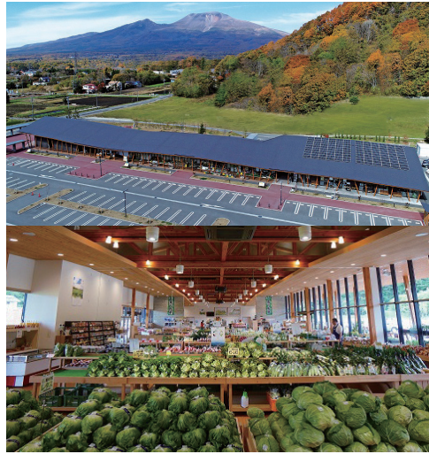
Community Farmer's Market "Karuizawa Hotchi Ichiba"

Easy to get to, this large property has a rare garden of roses on the lake. The natural garden is full of various plants and flowers. It even has a restaurant, café, and garden shop.