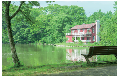
Karuzawa Taliesin (Lake Shiozawa)