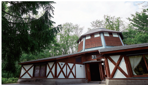
Museum Park Forest of Muse

The area around Lake Shiozawa is also known as a cultural area, dotted with art museums, literary museums, parks, and other facilities. In addition, the sports park in the Kazakoshi area allows visitors to enjoy a comprehensive range of sports, especially ice sports.