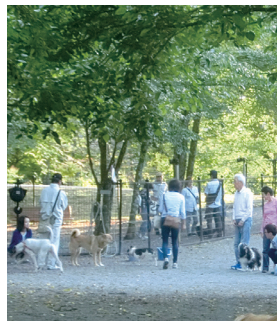
Yukawa Furusato Park

Konoe. After inheriting the building, the Ichimura family reconstructed and restored it. You can go inside for a look.