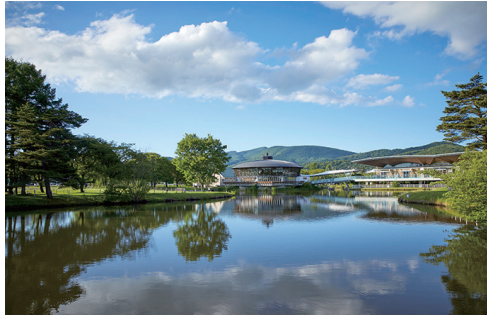
Karuizawa Prince Shopping Plaza

While offering majestic views of Mt. Asama, the area has many things you can actively enjoy, including sports such as golf, skiing, horseback riding and cycling, and an outlet malls where you can shop.