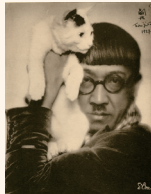
Léonard Tsuguharu Foujita