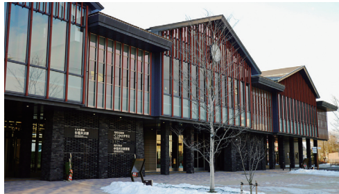
Nakakaruzawa Station Civic Center "Kutsukake Terrace"

With grand views of Mt. Asama, experiences such as strawberry picking in Karuzawa Kogen and jam making are also popular.