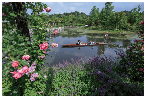
Karuizawa Lake Garden

Please have a great time exploring this new style of shopping and entertainment, in the beautiful setting of Karuizawa.