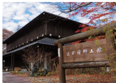
Karuizawa Oiwakejuku Folk Museum

This hall stores and displays documents related to Tatsuo Hori, a writer and poet who loved Karuizawa dearly. Featuring an exhibition room, where you can learn about the background of his life and literature, and his residence in his later years and library dedicated to his cherished book collection. His novel "Utsukusii Mura (The Beautiful Village)" tells you about the beginnings of the beautiful town of Karuizawa.