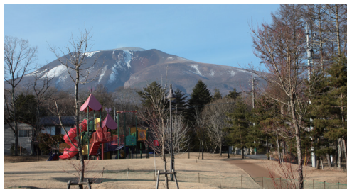
Asama Fureai Park

Famous as the shrine where the Meiji Emperor's envoy held a ritual to calm down the rumbling of the volcanic Mt. Asama. The main shrine is the oldest wooden construction in the neighborhood.