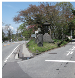
Oiwake no Wakasare

A nice place to relax while admiring Mt. Asama. Enjoyable for the young and old alike, featuring a multipurpose area, children's area, and mallet golf course. You can also go for a jog on the walkway (Dogs are prohibited in the grass areas).