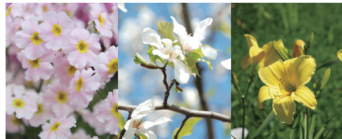
Karuzawa Botanical Garden (in Kazakoshi Park)

The only place where you can enjoy boating in Karuzawa. There are also museums, an English rose garden, restaurants, and places to play sports in the area.