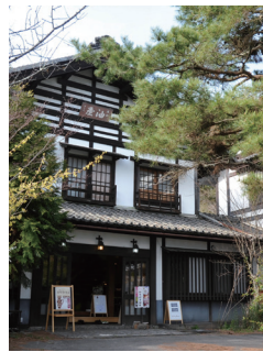
Culture Space Aburaya

This is the junction of the Nakasendo and Hokkoku Roads. There are a number of signposts and monuments that let you see a glimpse of the area's history.