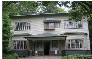
Former "Konoe Fumimaro Besso" (Ichimura Memorial House)

The Nakakaruzawa Library is open in the Kutsukake Terrace civic center. Provides a communal, relaxed environment where you can enjoy gathering information. A cafe bar is on the second floor, and five "challenge shops" are on the first floor.