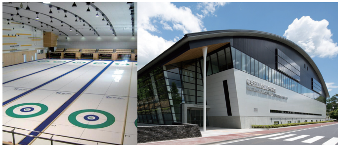
Kazakoshi Park Area

See and learn about native plants that grow in the Karuzawa Highlands.